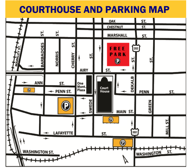
Free Parking, County lot, across from Norristown Post Office If the free lot is full, you may park at these other lots, at your own expense:

You have the right to file a complaint if your rights as a victim have been violated. If your complaint can't be resolved in a timely manner by the DA's Office, you may contact the Office of the Victim Advocate at the PA Commission on Crime and Delinquency.