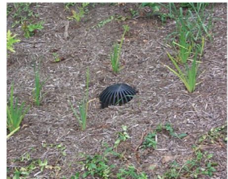
Domed riser for overflow