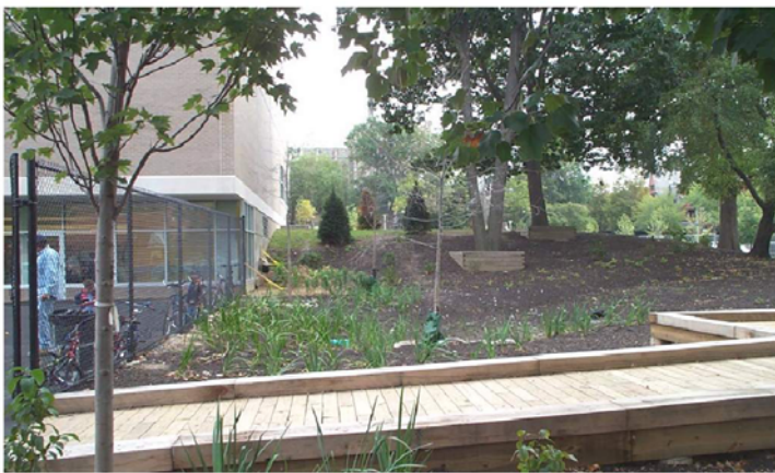
Raingarden at the Penn Alexander School in West Philadelphia