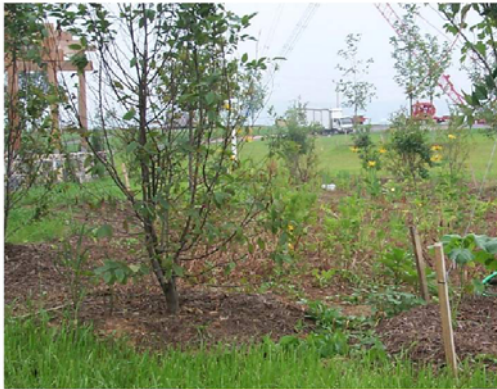
PSU / Centre County Visitor Center raingarden soon after construction

Sand Bed and Gravel Base lined with Geotextile Fabric