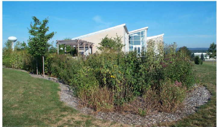
PSU / Centre County Visitor Center raingarden in full bloom