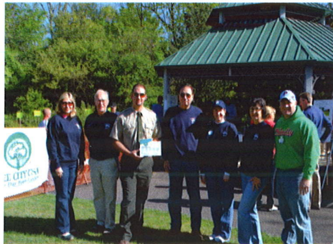
Members pictured from left are:

The Commission meets the third Wednesday of each month at 7:30 pm at the Township Building. The public is always welcome.