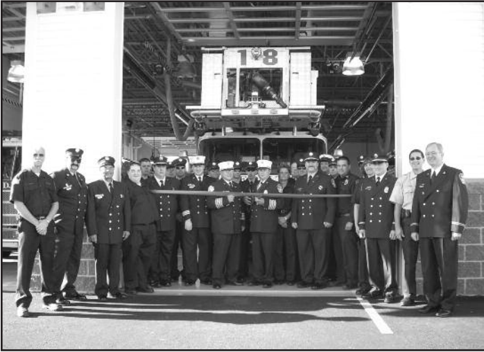
Members of the FDMT attend the dedication ceremony.