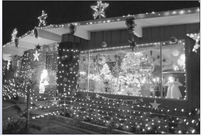
Congratulations to everyone who participated in the Holiday Lights contest. Best wishes for a healthy and prosperous 2007.

Participation in the "Holiday Lights" contest nearly doubled this year. Simply looking at lights was so two years ago. Now, residents can drive by and listen to light displays. This year, it was especially easy to find your way to Montgomery Township because of the sheer number of lights adorning the homes!