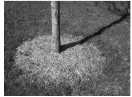
Proper mulching extends the life of a tree.